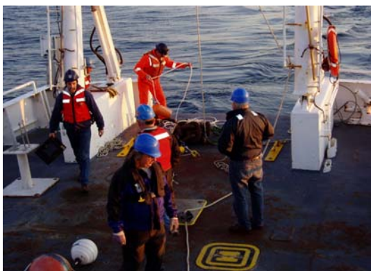
Ocean SAMP scientists aboard the URI research vessel Endeavor off Block Island

What exactly is the Ocean SAMP? The primary purpose of the Ocean SAMP is to serve as a coastal management and regulatory tool, based on the best available science, which promotes a balanced and comprehensive approach to the development and protection of Rhode Island's ocean-based resources. The Ocean SAMP will work towards achieving the following objectives: (1) Maintaining the ecology of the ocean resource; (2) Promoting and enhancing existing commercial and recreational fisheries activities; (3) Maintaining a healthy marine transportation network; (4) Promoting and enhancing existing recreational activities; (5) Determining appropriate and compatible roles for future activities within the study area, including offshore renewable energy infrastructure; and, (6) Building a framework for coordinated decisionmaking between state and federal management agencies. Accomplishing these goals and objectives will require engaging a well-informed, well-represented and committed public constituency to work with the Ocean SAMP project team to better understand the Ocean SAMP issues and the ecosystem, including the existing and potential uses of this area, and become involved in the creation of the Ocean SAMP policies and recommendations.